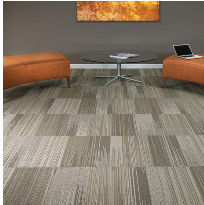
Carpet Option 2 Install Example Mannington Stock GDP