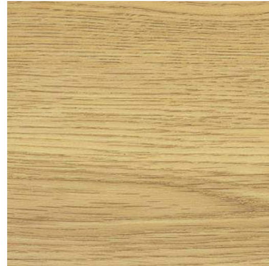
Work/Prep Room LVT Option 1 Mannington Spacia Pale Ash