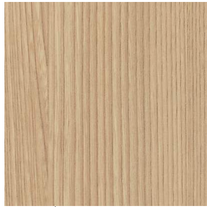
Casework Laminate Formica Woodbrush Aged Ash