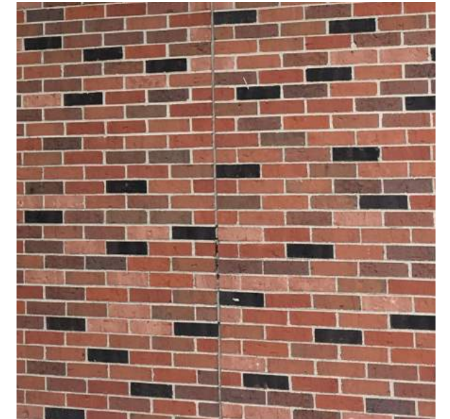
Existing Brick to Remain