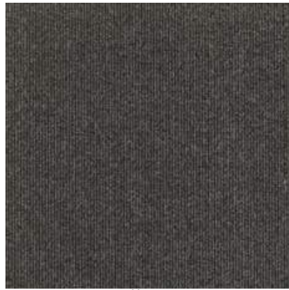
Vestibule Walkoff Mat J & J Invision Walkoff Fresh Face