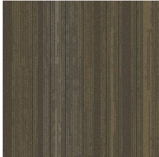
Carpet Option 1 Bolyu Verge Neck of the Woods