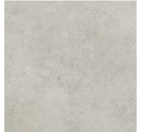
Work/Prep Room LVT Option 2 Mannington Spacia Ceramic Ecru