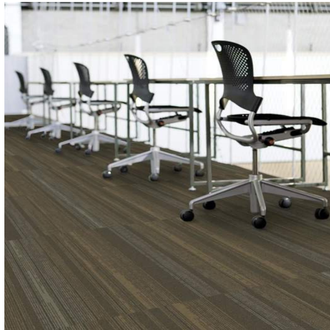
Carpet Option 1 Install Example Bolyu Verge Neck of the Woods