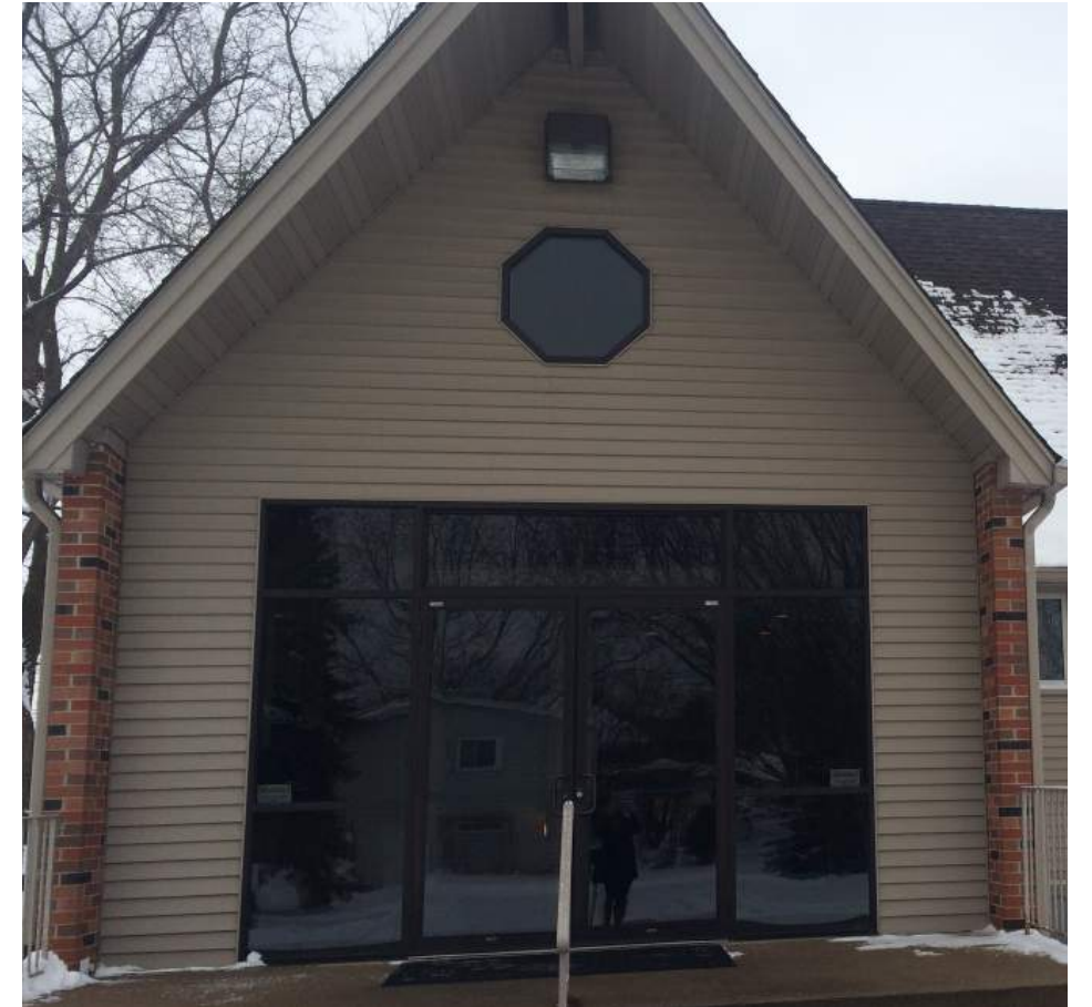
Existing Siding to Remain