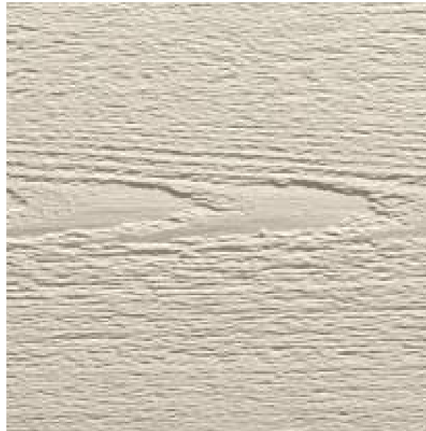
Exterior New Additional Panel LP Smartside - Cedar Panel Texture 4 x 8 Staggered