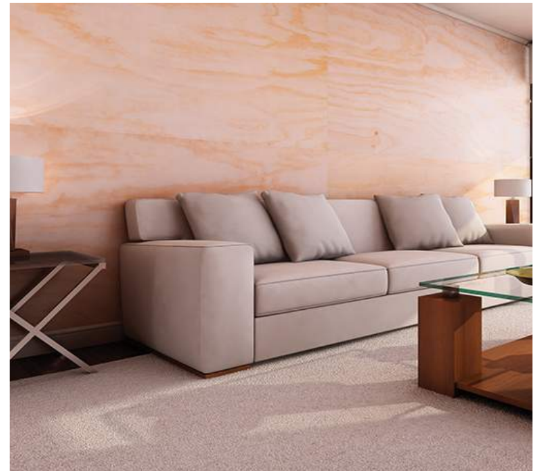
Assembly Wood Ceiling Selex Wood Plywood Panel 4 x 8 Staggered