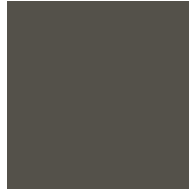
Exterior Gathering Walls Paint Color Sherwin Williams Urbane Bronze SW7048