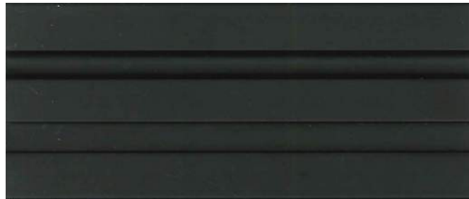
Exterior Glazing Aluminum - Dark Bronze