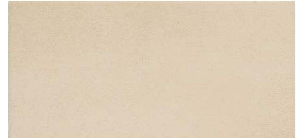
Restroom Floor Tile Daltile Volume 1.0 Aural Sand 12 x 24