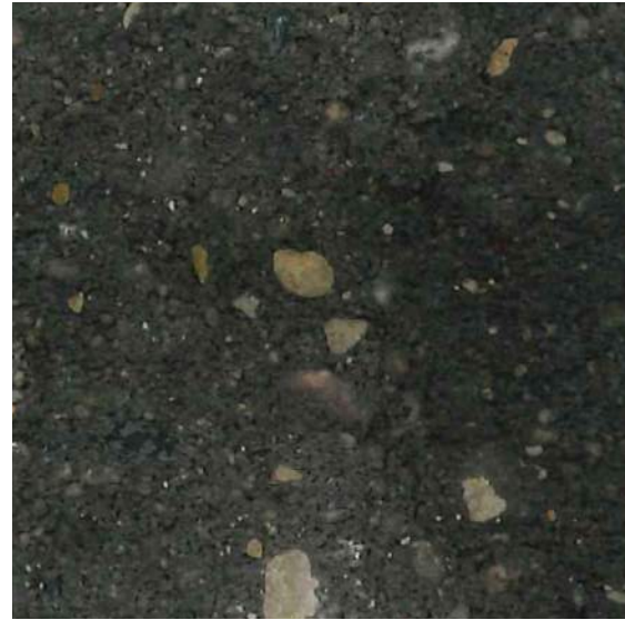
Exterior Rockface Block Amcon Shadow