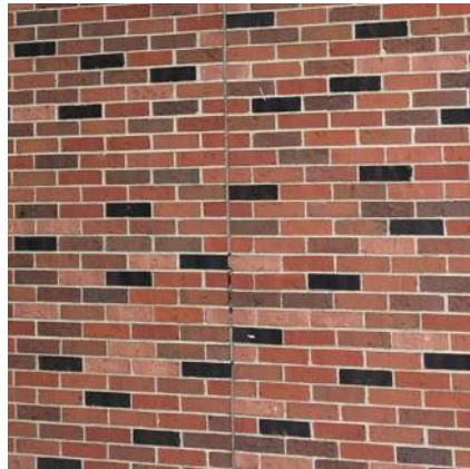
Interior Gathering Existing Brick to Remain